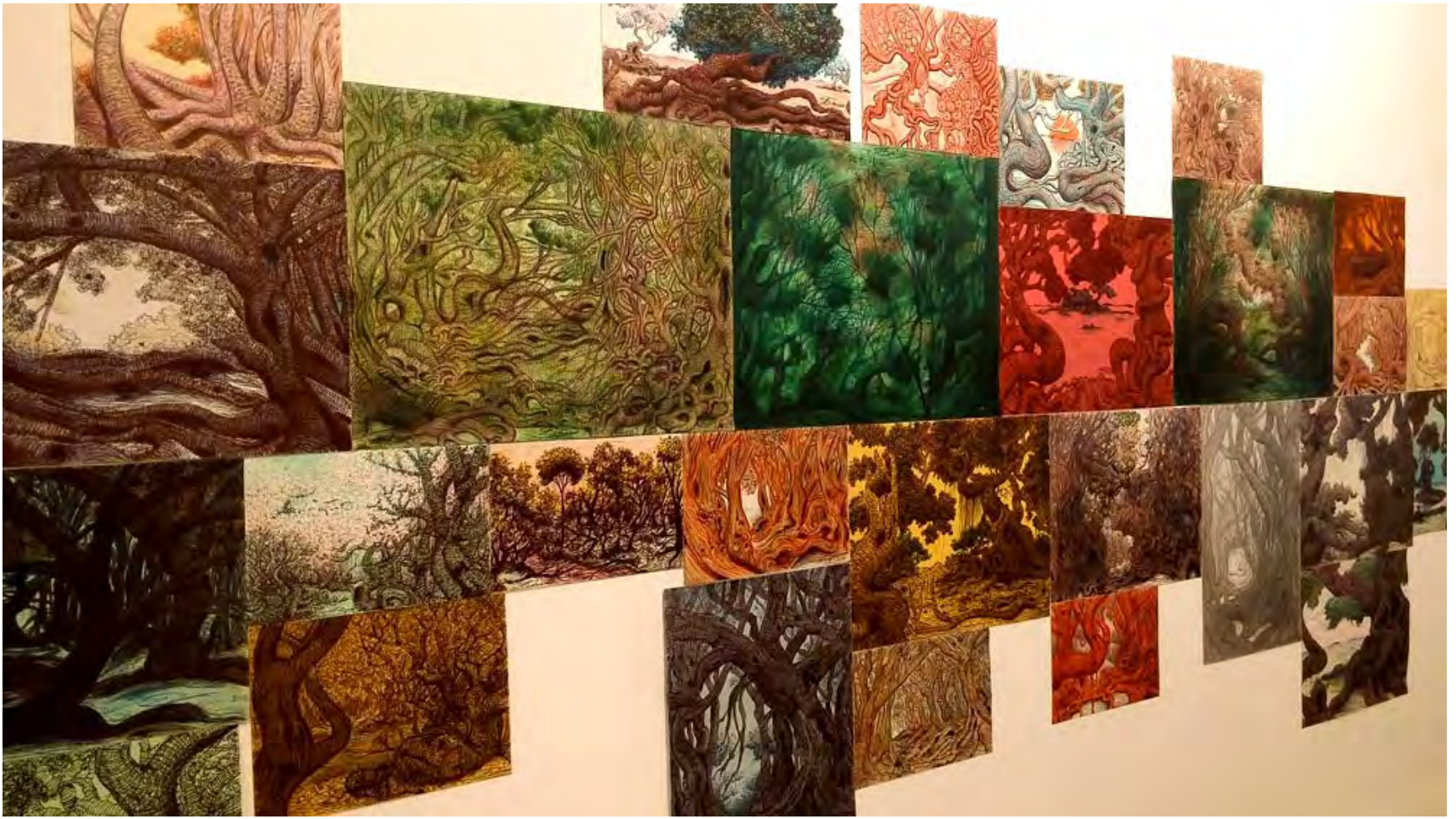
The Whispery Silence, an exhibition with drawings by Federico Garcia Cortizas at RIERA STUDIO | Art Brut Project Cuba until October 6 th , 2017.